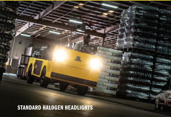
STANDARD HALOGEN HEADLIGHTS