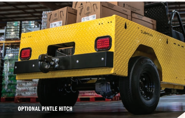
OPTIONAL PINTLE HITCH